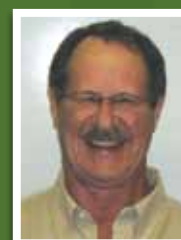
AL WALL Category B Toronto, ON